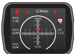
Self-Damping 3-Axis G-Meter