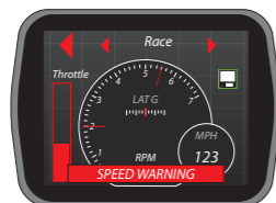
Audible Speed & RPM Warnings