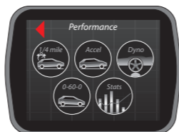
Acceleration & Braking Performance Tests