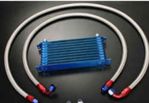
Deluxe Oil Cooler Kit with 2 Hoses

For more details about the Oil Cooler Kit , pls. click here for Autobahn88 2011 Catalog .