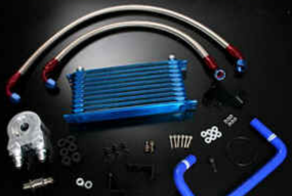
Toyota Land Cruiser AX100 98-07