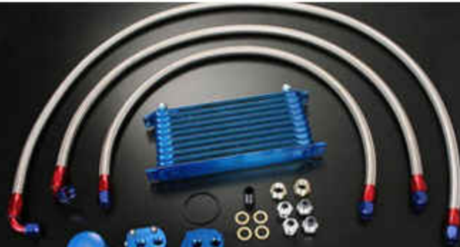
Deluxe Oil Cooler Kit with 3 Hoses