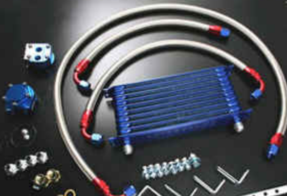
Mitsubishi Colt Z27A 4G15